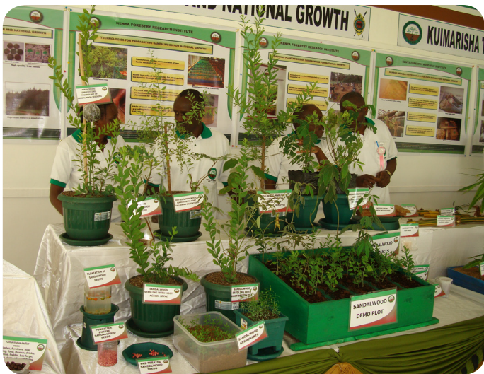
Display of Osyris products at Nairobi International Trade Fair