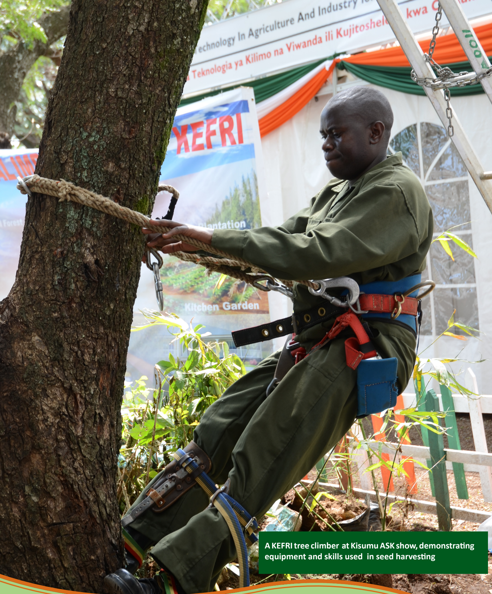
A KEFRI tree climber at Kisumu ASK show, demonstrating equipment and skills used in seed harvesting