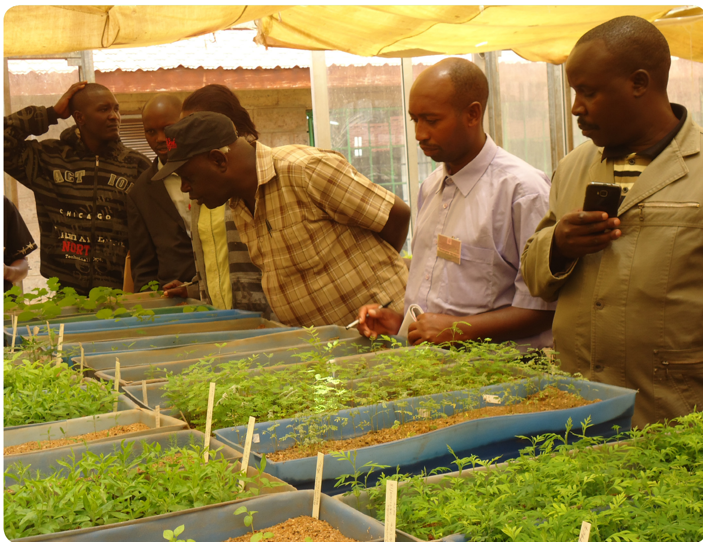
Participants learning seedlings germination techniques at the Kenya Forestry Seed Centre-Muguga

Due to rapid population growth demand for trees, forest products and services continue to increase leading to deforestation and environmental degradation. Such emerging challenges necessitate frameworks for improving and sustaining Participatory Natural Resource Management (PNRM) within which institutions and local people operate. One strategy for achieving sustainable development, management, conservation and utilization of natural resources is through building capacity of institutions involved in natural resource management.