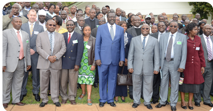
Participants who attended the PFM conference

Participants of the conference were drawn from all stakeholder segments in forestry sector including; forestry professionals, Community Based Forest Associations, National and County Policy makers, development partners and government institutions.