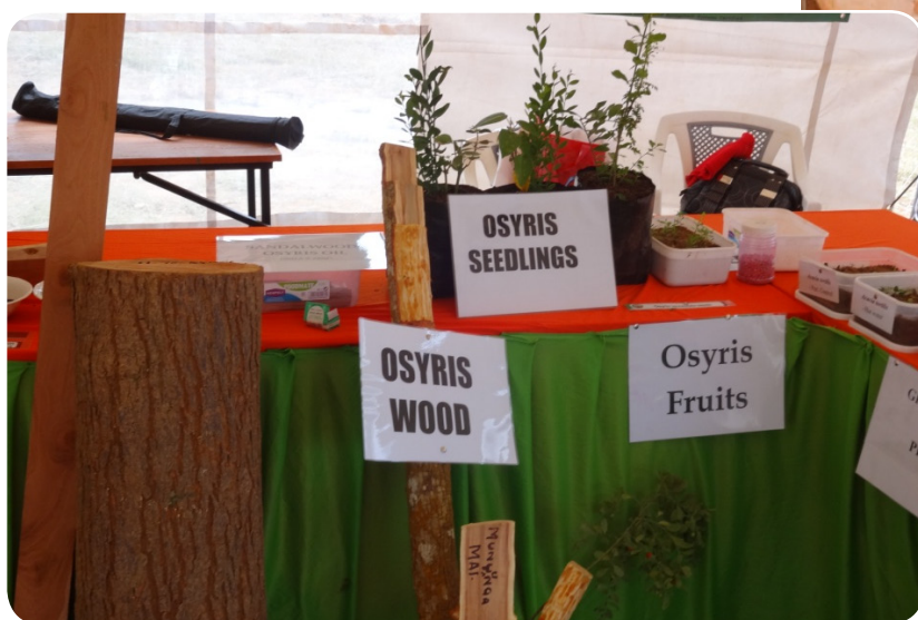
Osyris products and seedlings