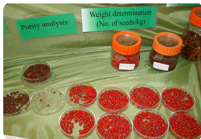
Some of the indigenous tree seeds earmarked for collection and conservation in Kenya