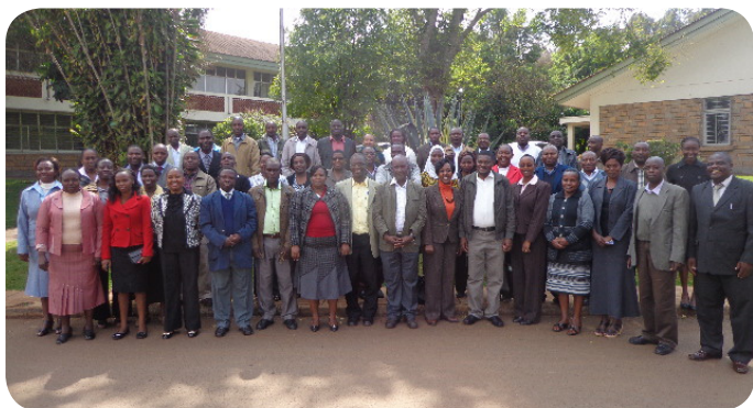
Knowledge Management focal points pose for a group photo after the training