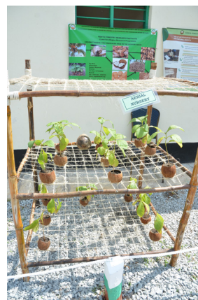
Coconut eco-potting tubes