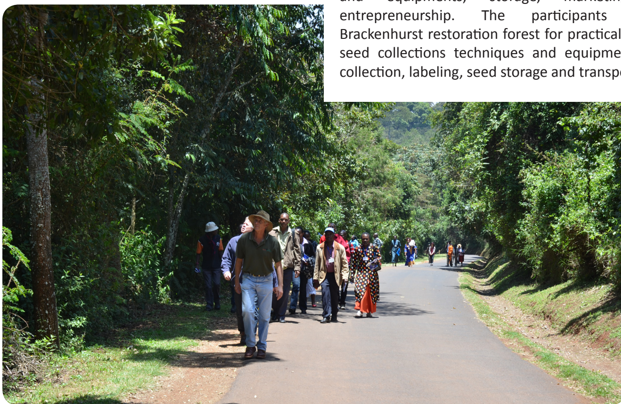
Tree seed course participants on practical session at Brackenhurst Forest

The course covered; seed collection techniques and equipments, storage, marketing and entrepreneurship. The participants visited Brackenhurst restoration forest for practicals in tree seed collections techniques and equipment, data collection, labeling, seed storage and transportation.