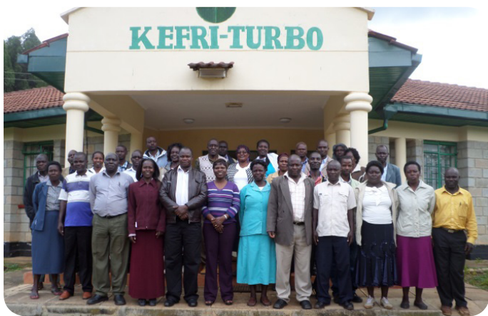
KEFRI Staff who attended QMS sensitization seminar at Turbo

The government of Kenya has made it mandatory for all Ministries, Departments and Agencies (MDAs) to implement Quality Management System ISO 9001:2008. Other than being a government directive, implementation of this system is of utmost importance and shall enable KEFRI make its operations effective and efficient.