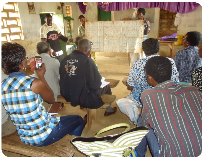
Muguga CFA members learn PFM process at Sokoke CFA

Thirteen members of Muguga Ecosystem Research Community Forest Association (MERCFA) made a 5-day visit to coast region from 18 th to 23 rd May 2014. Participants were drawn from tree nursery and bee-keeping groups from 5 villages adjacent to Muguga forest. The trip was sponsored by the Green Zones Development Support Project (GZDSP) through the Ecosystem Conservator- Kiambu office. The MERCFA is currently being mentored by KEFRI.