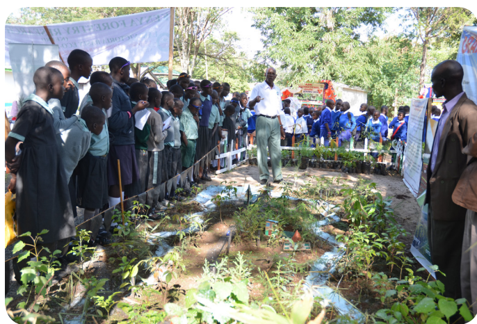
Model of multipurpose trees (MPTS) at Kisumu show

KEFRI displayed technologies and products on forestry and allied natural resources for adoption by stakeholders in the Lake Victoria Basin and neighbouring Eco-regions.