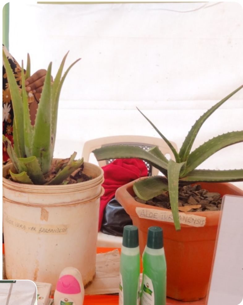
Aloe products and seedlings

The Kisii show was held from 10 th to 13 th July 2014, at the Gusii show grounds. KEFRI was ranked the 1 st in the category of “Best Medium Government Stand and awarded a trophy by the Kisii County Governor. 1,800 people visited the stand amongst them, the County Minister of Agriculture, Livestock, Fisheries and Cooperative Development Hon. Vincent Sagwe.