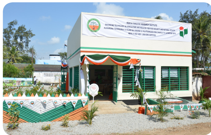
KEFRI newly constructed stand at Mkomani ASK showground, Mombasa

KEFRI Coast Eco-region Forestry Research Programme (Gede) participated at Mombasa International show from 27 th to 31 st August, 2014. The institute displayed several forestry technologies at the Mombasa Show. Displays unique to the coast included: establishment, management and utilization of Casuarina equisetifolia , and coconut eco-potting tubes. Strategies being undertaken by Kenya Coastal Development Project (KCDP) to increase forest cover to 10% and rehabilitate key coastal water catchments were also displayed.