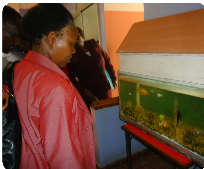
MERCFA members admiring fish farming aquarium which is an alternative income generating activity