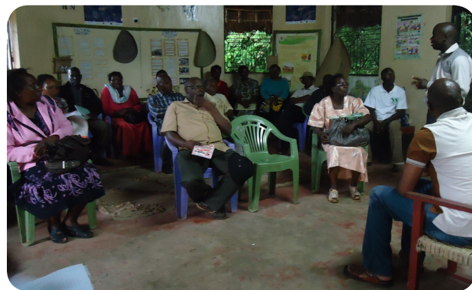
CFA members at Kaya Kinondo Forest Eco-tourism site where they learnt eco-tourism development approaches

Lessons learnt from the visit will go a long way in assisting MERCFA members improve the state of Muguga eco-system and adjacent community livelihood. MERCFA members thank Green Zones Development Support Project (GZDSP) for sponsoring the tour.