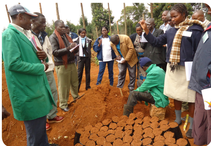
Participants doing potting at Greenland Agroforestry nursery - Gakoe

The participants learnt and shared experiences on: species selection and identification; seed collection, processing and handling; appropriate nursery practices; entrepreneurship; propagation through seeds and alternative methods. Field visits were made to institutional and community tree nurseries.