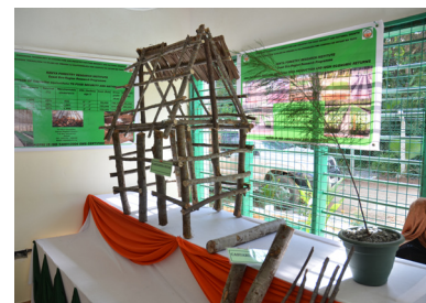
Casuarina poles used for construction